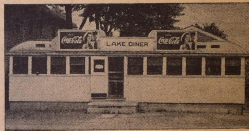
HARPER'S LAKE DINER